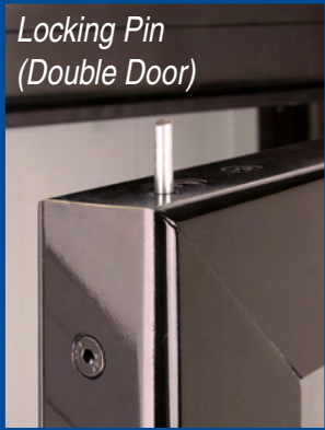
Locking Pin (Double Door)